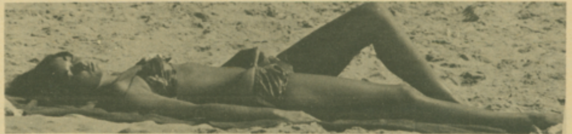
HARK! THOSE DAYS of wine and roses (beach and beer?) may soon be over--Dead Week is but six weeks away. Don't say you weren't warned.

His comments were in a speech prepared for a Democratic fund-raising appearance in Pleasanton.